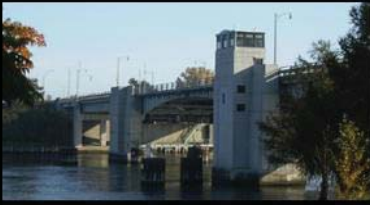
Building Bridges • Transforming Lives