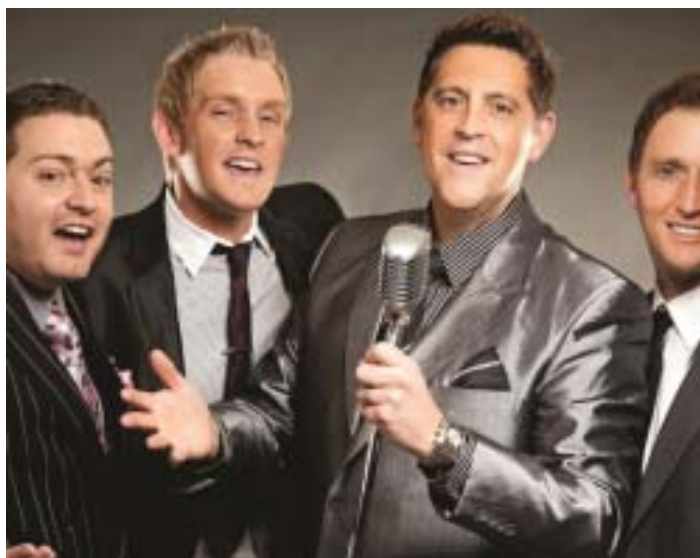
Ernie Haase & Signature Sound

Cost is $25 (plus your dinner). Register no later than February 13 for this inspiring event.